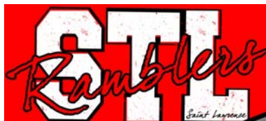
Design 1 Screenprint

Two color Screenprint. Distressed Appearance. Small one color version for Shorts.