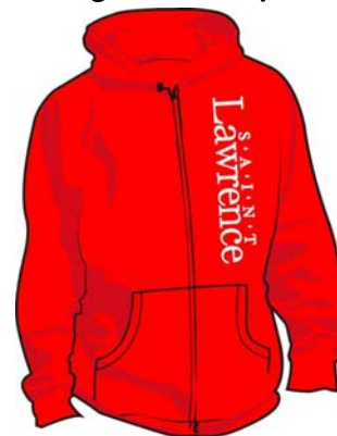
Design 3 Screenprint

One color Screenprint for Full Zip Hoodie Only.